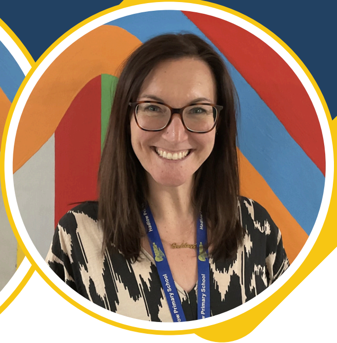
FAMILY LIAISON OFFICER DEPUTY SAFEGUARDING LEAD MENTAL HEALTH FIRST AIDER