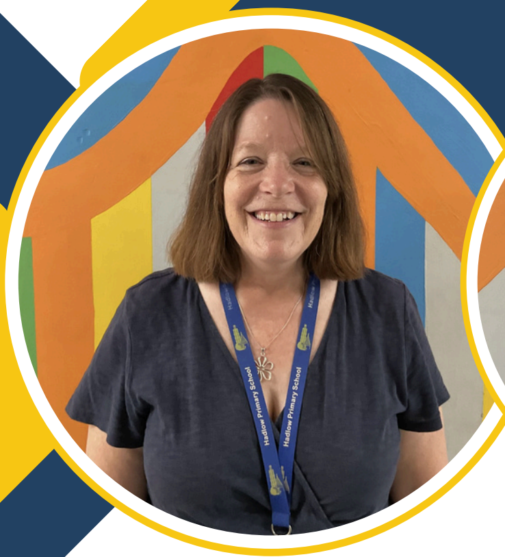
SENCO AND DESIGNATED SAFEGUARDING LEAD